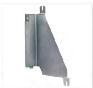
Panel Mounting Bracket C03-4002-101 (KCD-3PB)

The industrial KCD-300 media converter series provides industrial strength Ethernet copper-to-fiber media conversion, allowing for 10Base-T-100Base-FX or 100Base-TX-100Base-FX over multi-mode or optional single-mode fiber optical media.