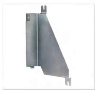
Panel Mounting Bracket C03-4002-101 (KCD-3PB)

The industrial KCD-300 media converter series provides industrial strength Ethernet copper-to-fiber media conversion, allowing for 10Base-T-100Base-FX or 100Base-TX-100Base-FX over multi-mode or optional single-mode fiber optical media.